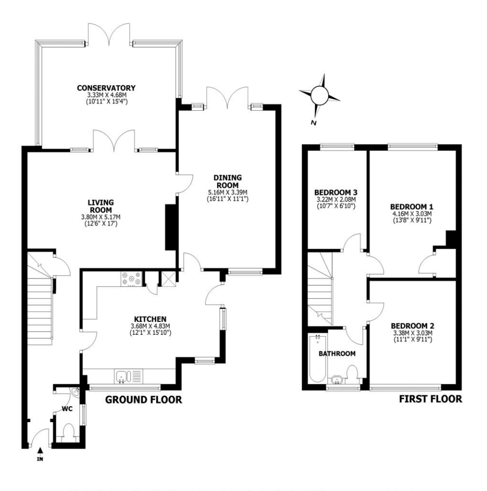
This floorplan shows maximum dimensions, excluding small alcoves etc unless otherwise stated. Measurements are approximate and are given as a guide only. They are not intended to be used for carpet sizes, window furnishings, appliance sizes, or items of furniture.

For Sale with No Onward Chain - A three bedroom semi-detached home having been extended on the ground floor to give three reception rooms plus a kitchen diner. Also benefitting from south facing rear garden. Internally this is a spacious home with three good bedrooms and a family bathroom on the first floor. The ground floor has been extended to give three reception rooms and a sizable kitchen diner. There is also a downstairs cloakroom. There is plenty of space to work with. The rear living space and conservatory is currently used as a fourth bedroom but more conventionally would be a lovely space opening onto the south facing garden. The garden is deep and wide and there is a pretty outlook to the rear. You also have off street parking to the front of the home. This home is nicely located within this popular residential road within the village of Row Town. At the top of the street there is the parade of local village shops and amenities and there are two popular village primary schools plus a village pub. There is also a good selection of secondary schools within the area. Row Town is also a popular area for those that commute by road with access to the M25, A3 and M3 all close by.